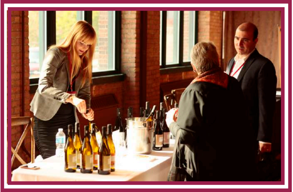
Wine tasting at IWE 2015.

Workshops will provide key promotional opportunities for exhibitors to connect with large groups of potential clients and partners.