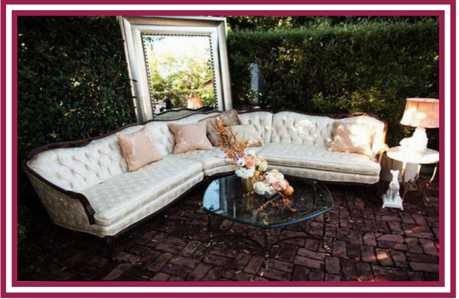
Design concept from preliminary IWE 2016 aesthetics proposal.

In a casual living room setting buyers will be able to meet and hear about producers' production process. With all the time that goes into making your product, we create an environment where buyers can relax and take the time to fully experience it. This ensures better retention of information and later they can better promote products purchased.