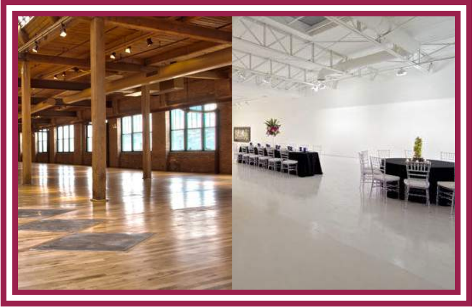
Chicago - The Bridgeport Art Center

The Bridgeport Art Center – located just south of downtown Chicago – is equipped with the space (12,000 sq. feet) and the parking to accommodate thousands of visitors.