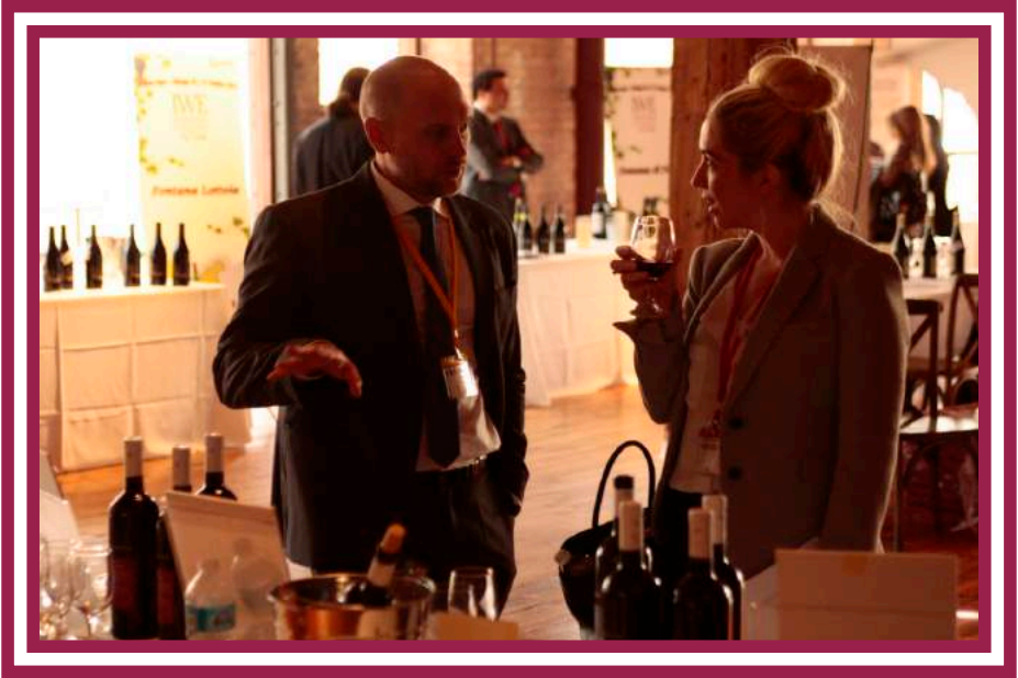
Wine tasting during IWE 2015.

IWE has a unique niche in the tradeshow market. We target quality international producers and introduce them to our trusted circle of buyers who value the integrity of the production process.