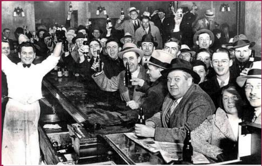
Chicago - the end of prohibition.

With over 2.7 million citizens and 590 billion in revenue, Chicago is the third most populous city with the third largest metropolitan area in the United States.